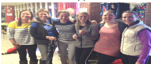
SPSA Super Swimathon Team

We exist to support the school and supplement/pay for things that will enhance and broaden the pupils educational opportunities and resources. We do this through a range of fund-raising activities. For example last year we raised over £3000 (WOW!) doing a Super Swimathon. This money will go towards the cost of a new roof for the school community pool.